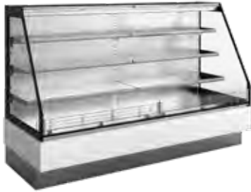
SM HF2 CC with stainless steel back