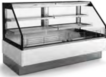
SM HF2 CC with see-through back