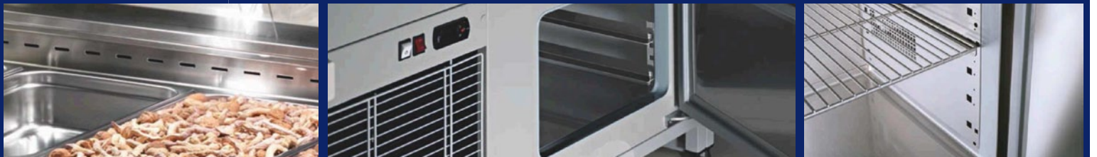
Salad/Prepared Foods Display